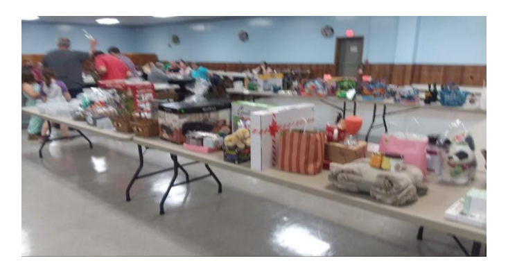
The 100+ donated raffle items