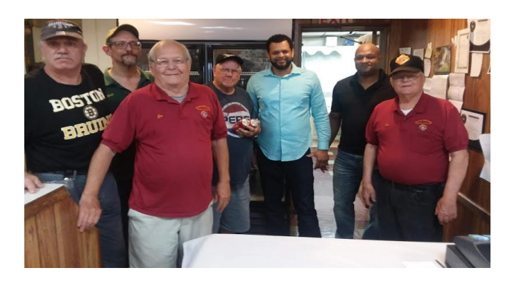
The Sullivan Council kitchen crew

On June 7<sup>th</sup>, Sullivan Council held an event to raise money for the Council's charities. Over 100 raffle items were donated and approximately $1600 dollars were raised.